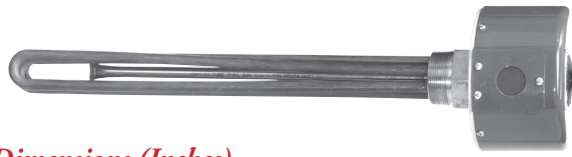
E1 — Dimensions (Inches)